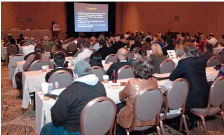
Researchers, clinicians and gaming industry representatives came together at the 2010 NCRG Conference on Gambling and Addiction.